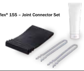
KRASOflex® 155 – Joint Connector Set

Scope of supply: KRASOflex® 155 , joint connector set with joint connector and plastic adhesive, 2 joint clips