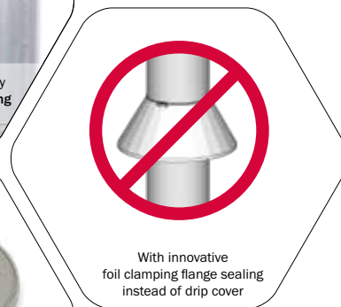
With innovative foil clamping flange sealing instead of drip cover