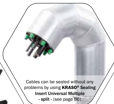
Cables can be sealed without any problems by using KRASO® Sealing Insert Universal Multiple - split - (see page 86)