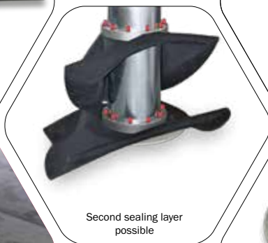
Second sealing layer possible