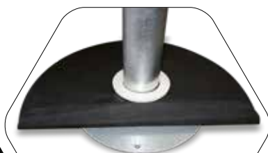
UV protection with surrounding peripheral drip edge at the underside, anti-twist lock, KRASO® Foil Clamping Flange Type FKF