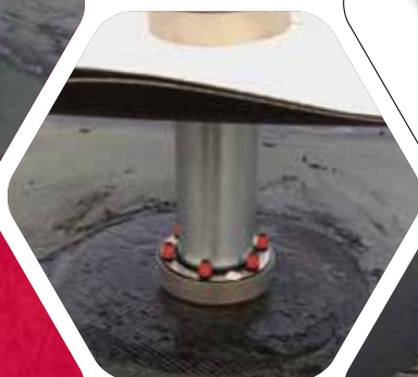
UV protection with surrounding peripheral drip edge at the underside, anti-twist lock