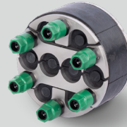
KRASO® Sealing Insert Universal Multiple - split - 100 Design 3