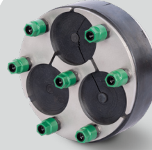
KRASO® Sealing Insert Universal Multiple - split - 150 Design 1