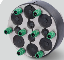
KRASO® Sealing Insert Universal Multiple - split - 150 Design 2