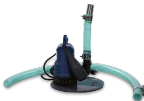
KRASO® Pump Sump Poly 400 - complete - pump