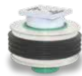
KRASO® Floor Drain - thermally insulated -