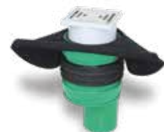
KRASO® Floor Drain Type FS - RS with foil flange frost proof - backwater safe