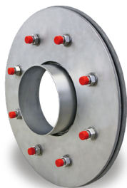
KRASO® Casing Type FL/ZA - for dowel-fixing -