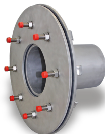
KRASO® Casing Type FL/ZE - for concreting -