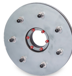
KRASO® Sealing Insert Type FL/DD - double sealing -