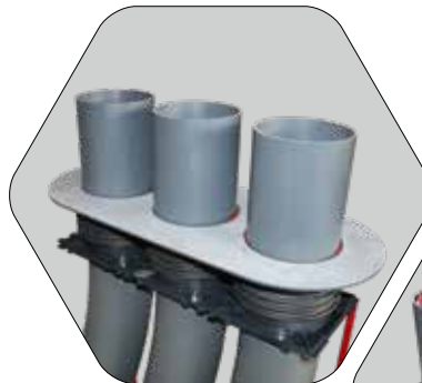
KRASO® KDS 150 Empty Pipe Insert example of installation of media lines using KRASO® Sealing Inserts

KRASO® Cable Inlet Box System KDS 150 available with KRASO® Trowel Flange roughened plastic-trowel flange for the integration into the floor sealing / sealing sheets