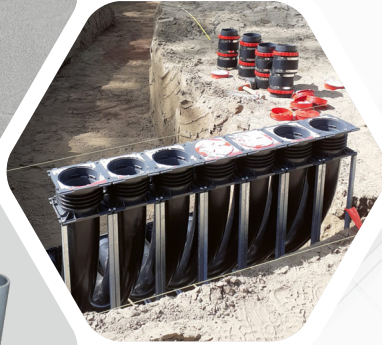
KRASO® Cable Inlet Box System KDS 150 available with KRASO® Trowel Flange roughened plastic-trowel flange for the integration into the floor sealing / sealing sheets

KRASO® Cable Inlet Box System KDS 150 Check the installation video (Just scan the QR code!)